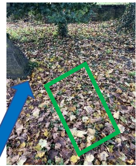
Newsome headstone and cross